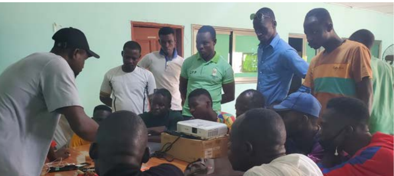
Photo : Participants at the 'Microenterprise project' implemented at Nalerigu, Ghana during YDOS 2022

The following key outputs were achieved from projects implemented by young people under the Goal 8 of the SDGs during the YDOS 2022