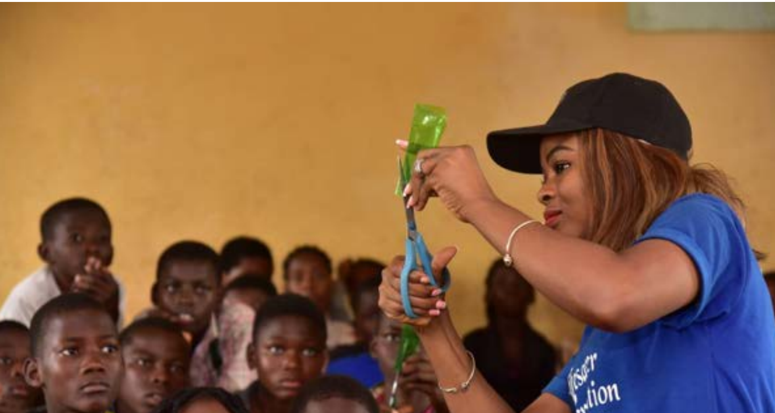
Photo : Children at Upcycling bottles project at Magboro , Ogun state, Nigeria during YDOS 2022

The following key outputs were achieved from projects implemented by young people under the Goal 12 of the SDGs during the YDOS 2022