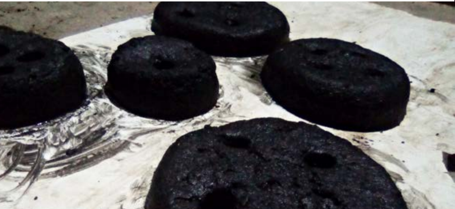
photo : Affordable charcoal briquettes produced at the 'charcoal briquettes production project' in Lusaka, Zambia during YDOS 2022

The following key outputs were achieved from projects implemented by young people under the Goal 7 of the SDGs during the YDOS 2022