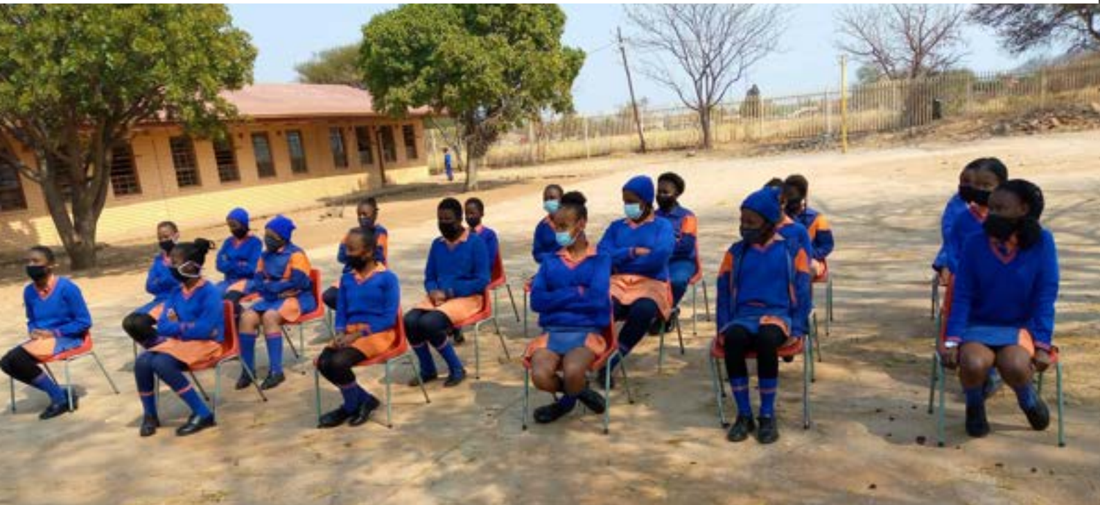
photo: A cross section of students at the 'For Youth by the Youth Project' in Pretoria, South Africa during YDOS 2022

The following key outputs were achieved from projects implemented by young people under the Goal 4 of the SDGs during the YDOS 2022