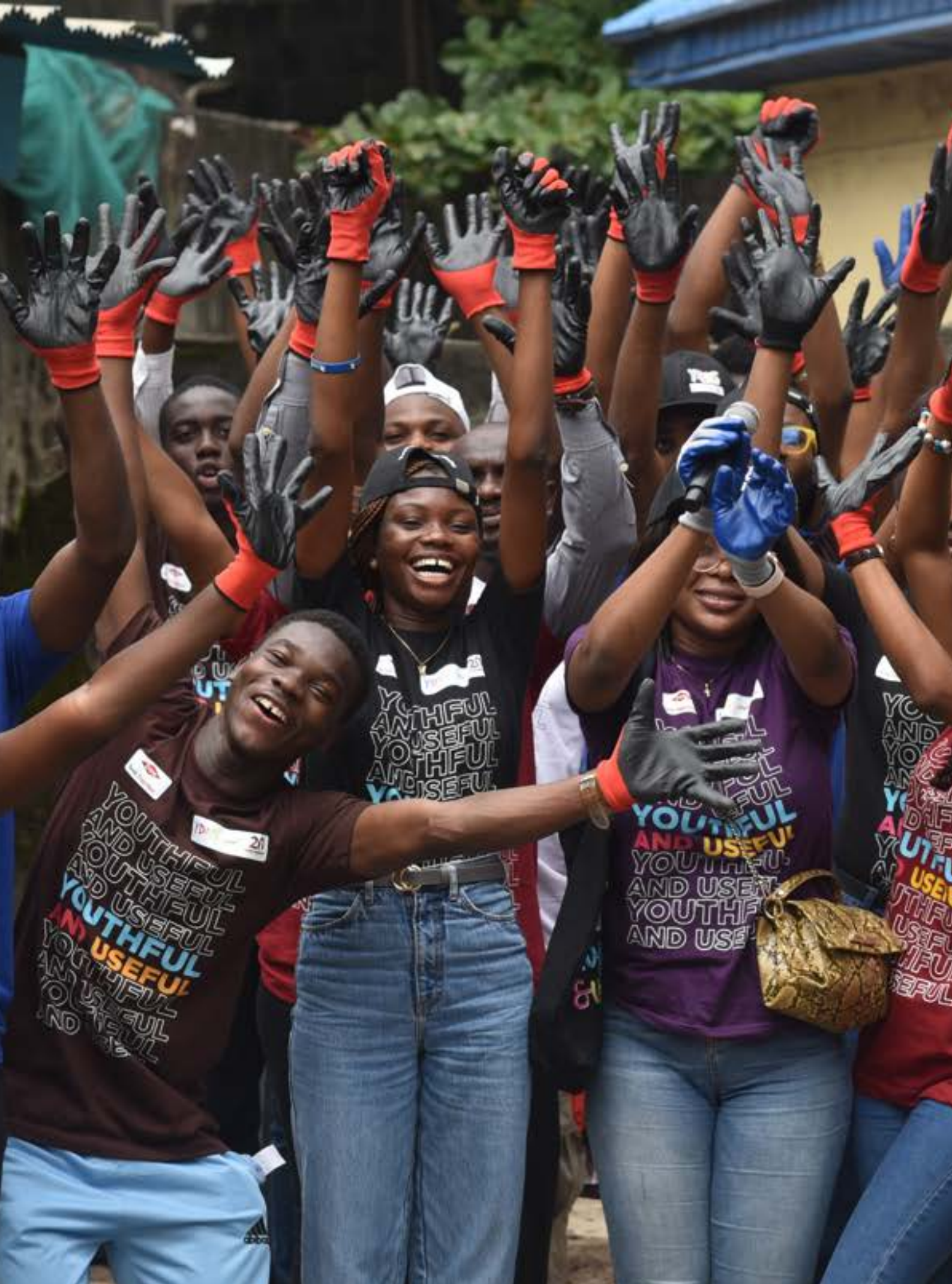
Photo: A group of YDOS volunteers at the 'Plant and Paint project' organised by LEAP Africa, in Lagos, Nigeria