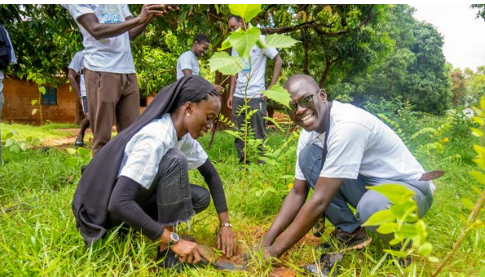
Photo : Volunteers at a tree planting project in Bakau, The Gambia during YDOS 2022

The following key outputs were achieved from projects implemented by young people under the Goal 15 of the SDGs during the YDOS 2022