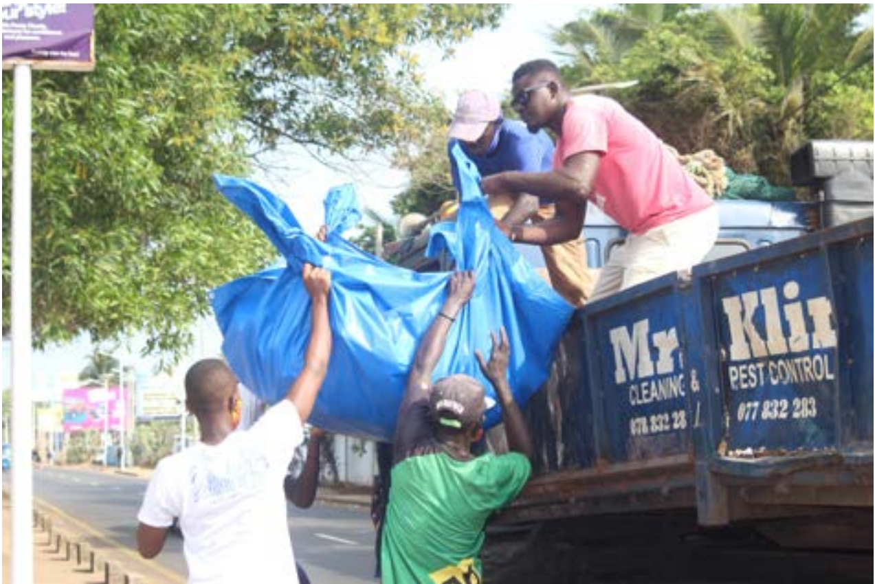
Photo : Volunteers at the 'Beach Clean Up Action project' at Lumelu Beach, Free town , Sierra Leone during YDOS 2022

The accumulation of non-biodegradable waste on land and water has negative impact on the environment. For one, it poses a health threat to residents in the communities as well as animals in surrounding water bodies. To address these threats a team of youth volunteers from the western area of Free town in Sierra Leone came up with an idea to carry out a clean up project at Lumley beach.