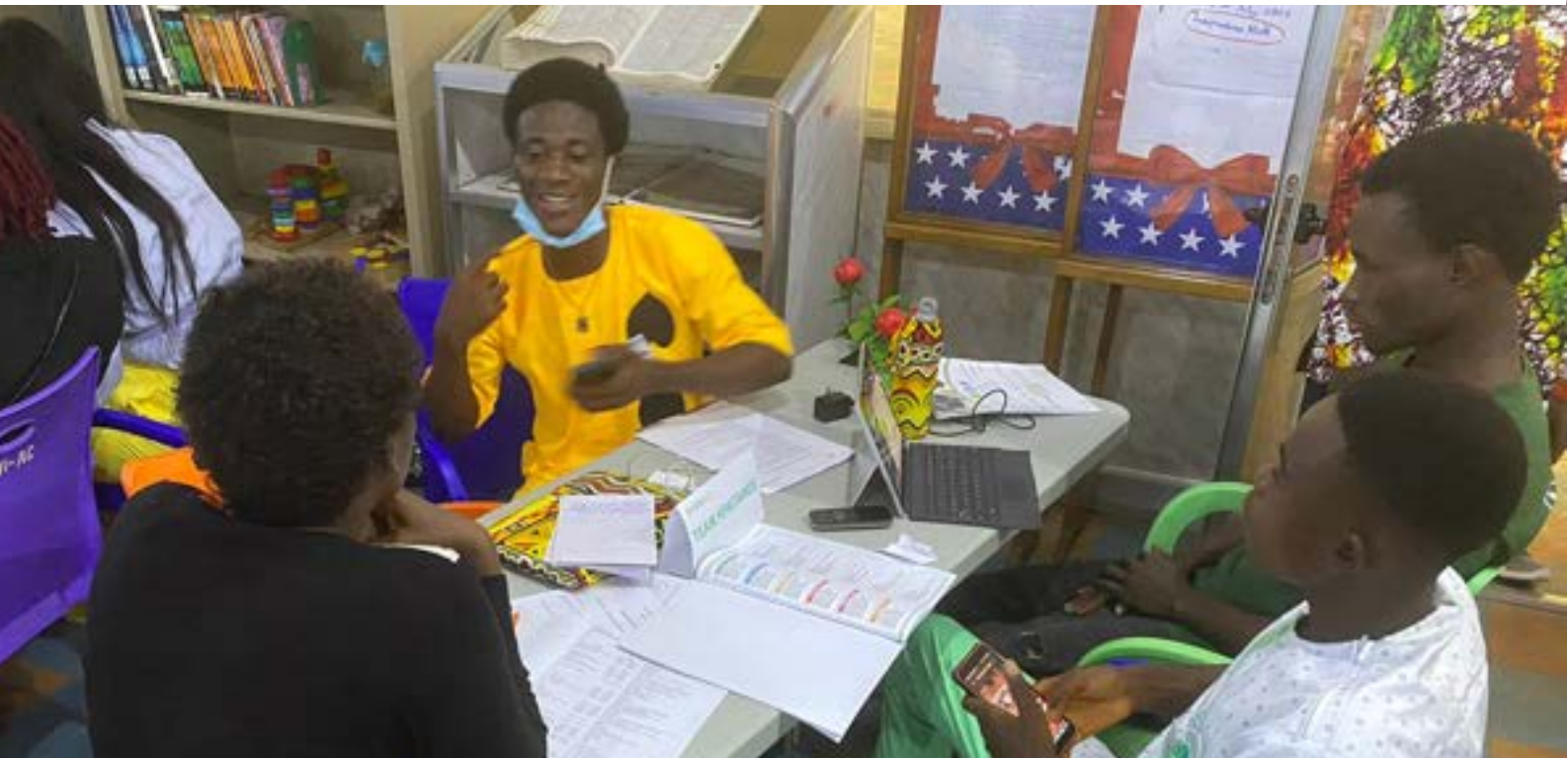
Photo : Participants sharing ideas at the International Youth Day Symposium in Kakata City , Liberia

The following key outputs have been achieved: