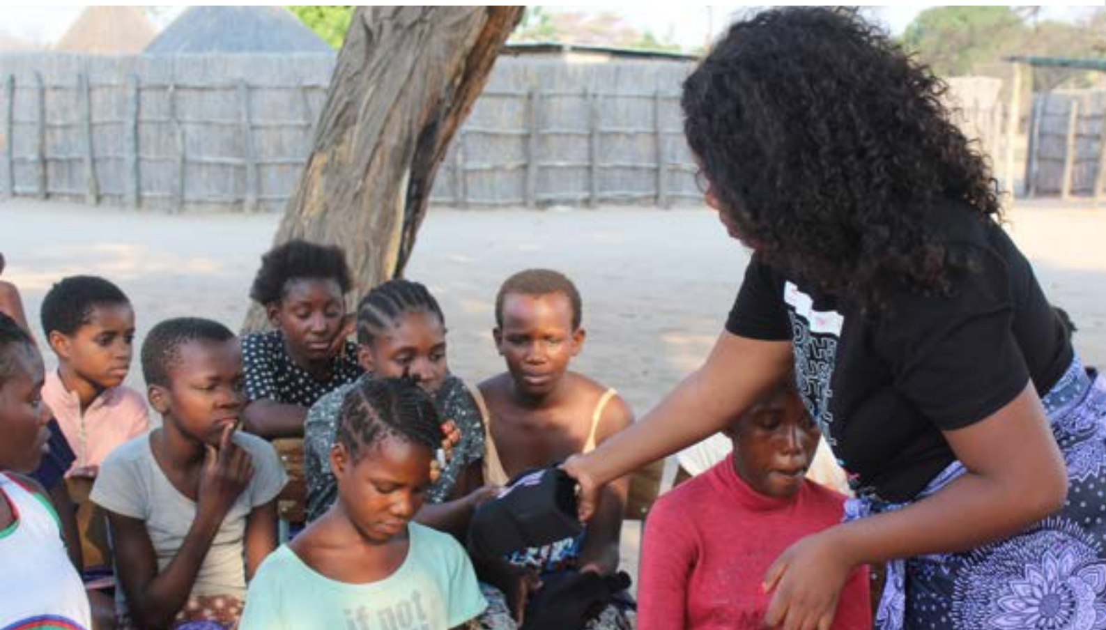
photo: A group of girls receiving clothings during the 'Zambezi girls project' in Zambezi, Namibia

The following key outputs were achieved from projects implemented by young people under the Goal 5 of the SDGs during the YDOS 2022