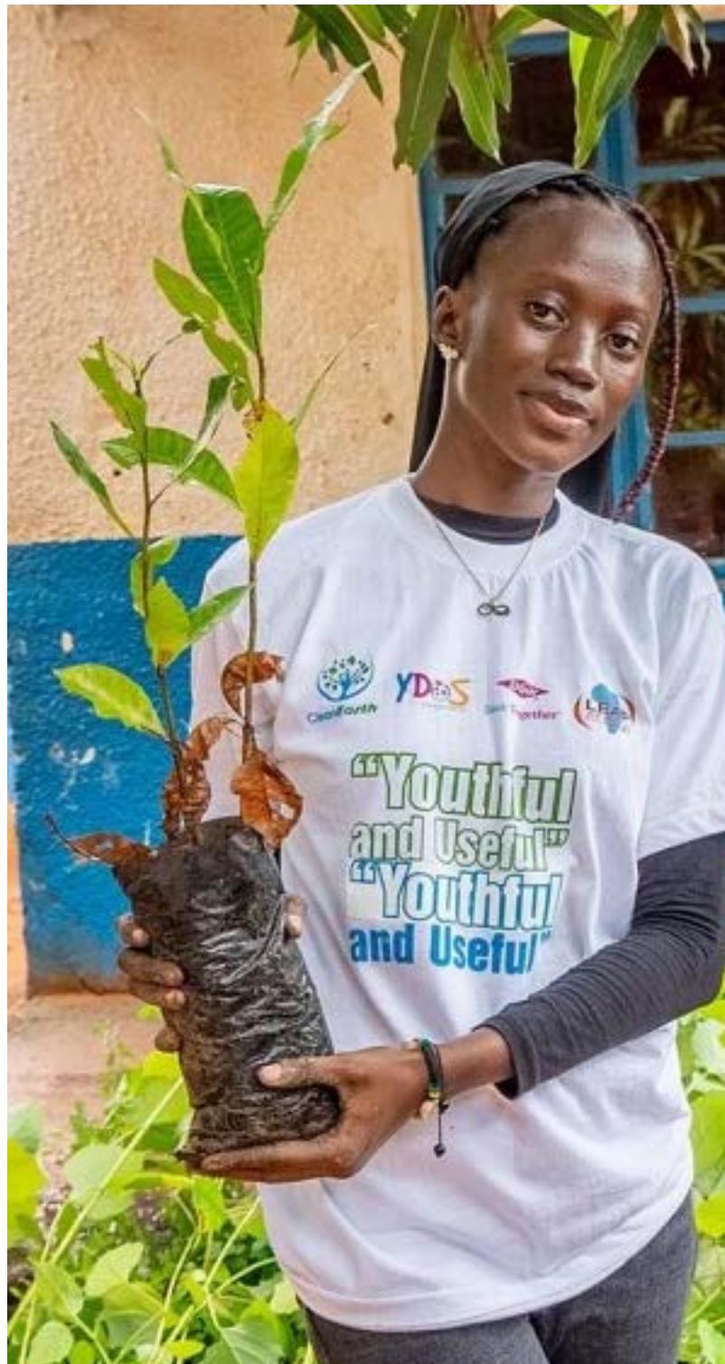
Photo: A YDOS 2022 volunteer during a tree planting exercise in Banjul, The Gambia

The youth of Africa are willing and ready to take actions towards attaining sustainable development in their communities. All hands must be on deck to support them in this journey.