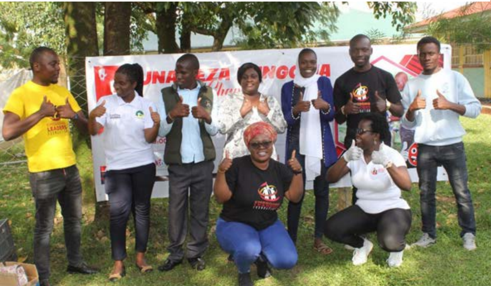
photo: A group of YDOS 2022 volunteers Led by Emerging Leaders Africa (ELF) at a blood donation exercise in Bungoma, Kenya

The following key outputs were achieved from projects implemented by young people under the Goal 3 of the SDGs during the YDOS 2022