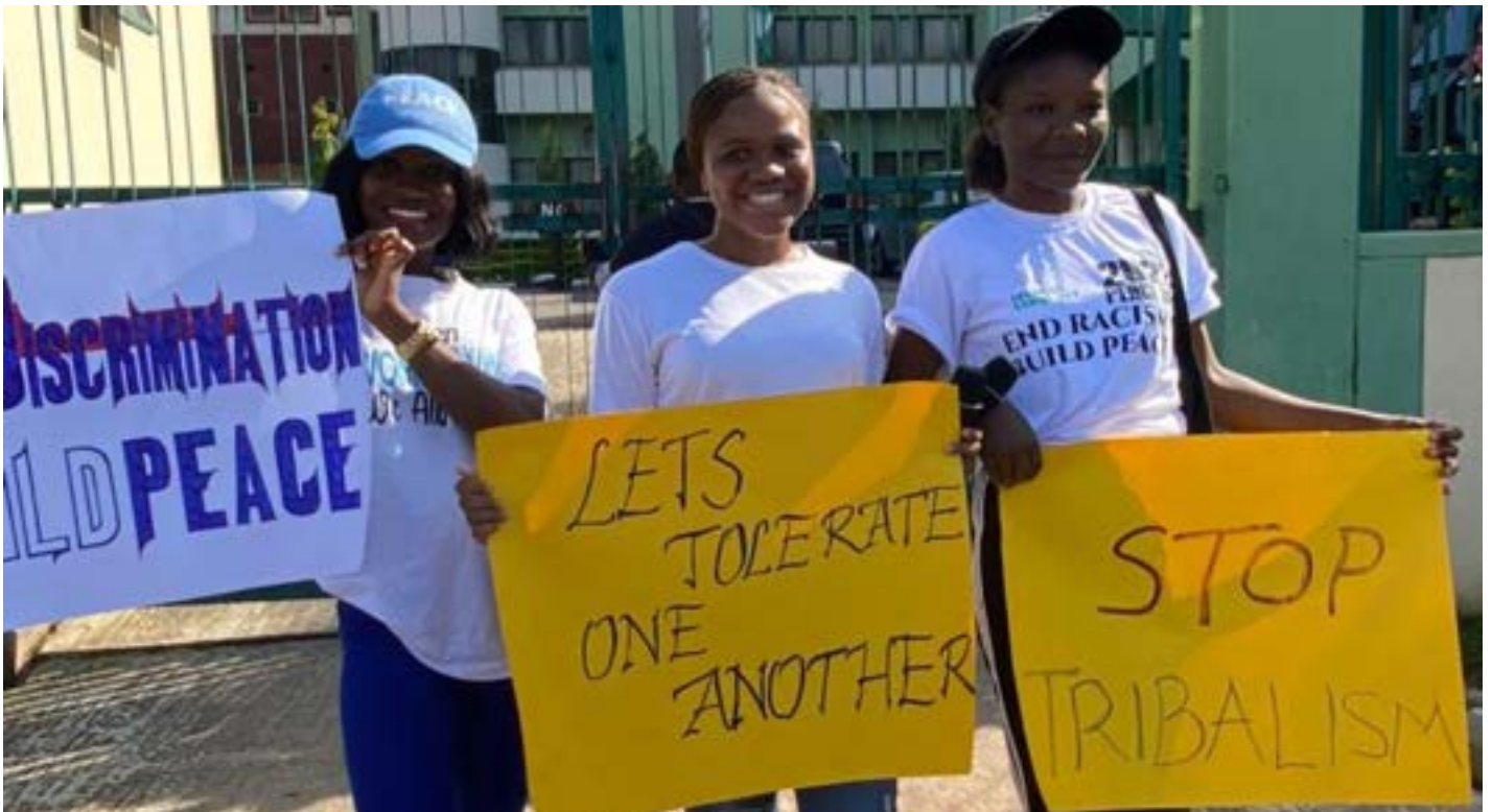
Photo : Volunteers at the Take a Walk Campaign in Abuja, Nigeria during YDOS 2022

The following key outputs have been achieved: