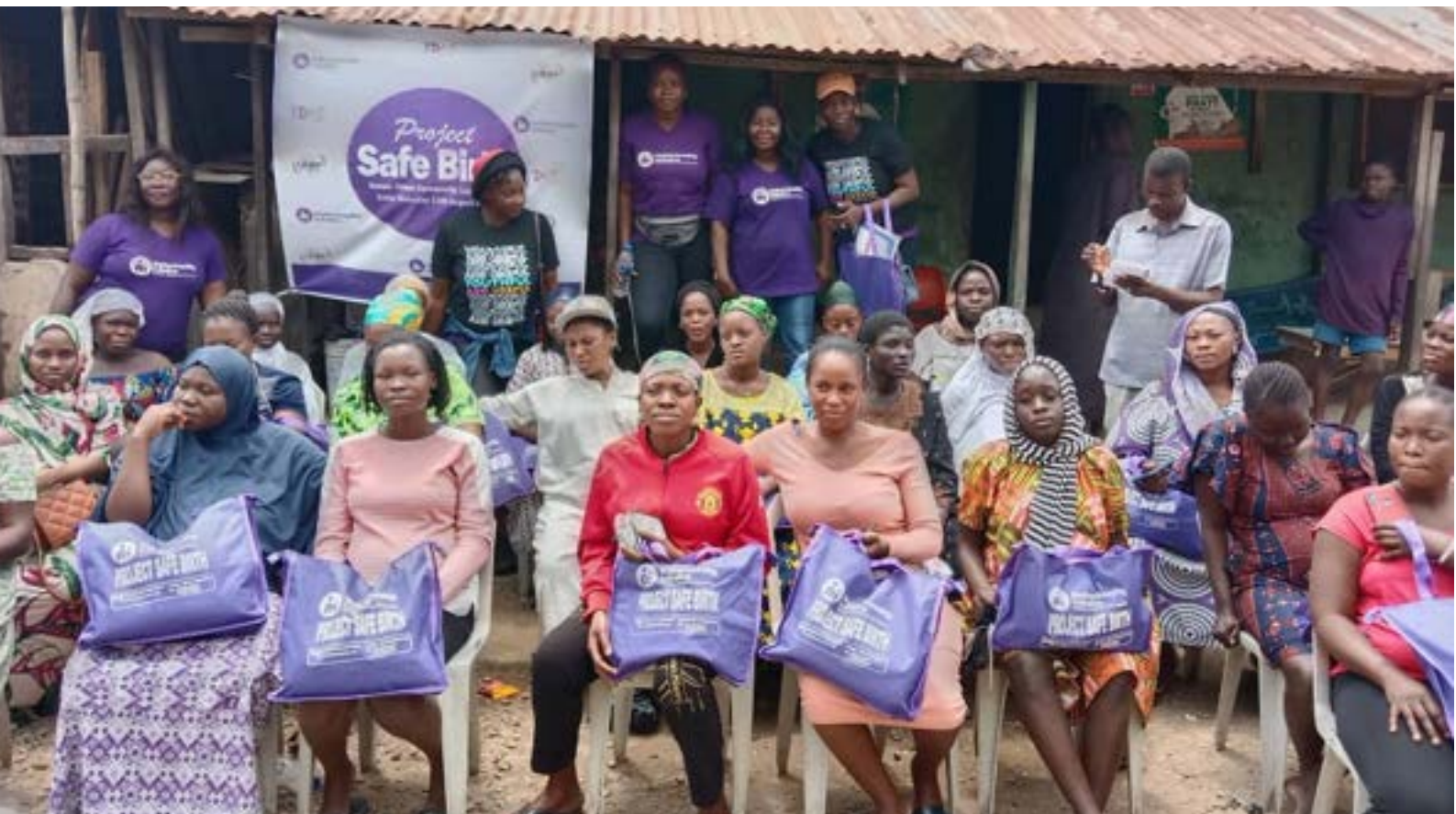
photo: Participants at the 'vocational training for Women project' in Lagos, Nigeria during YDOS 2022

The following key outputs were achieved from projects implemented by young people under the Goal 1 of the SDGs during the YDOS 2022