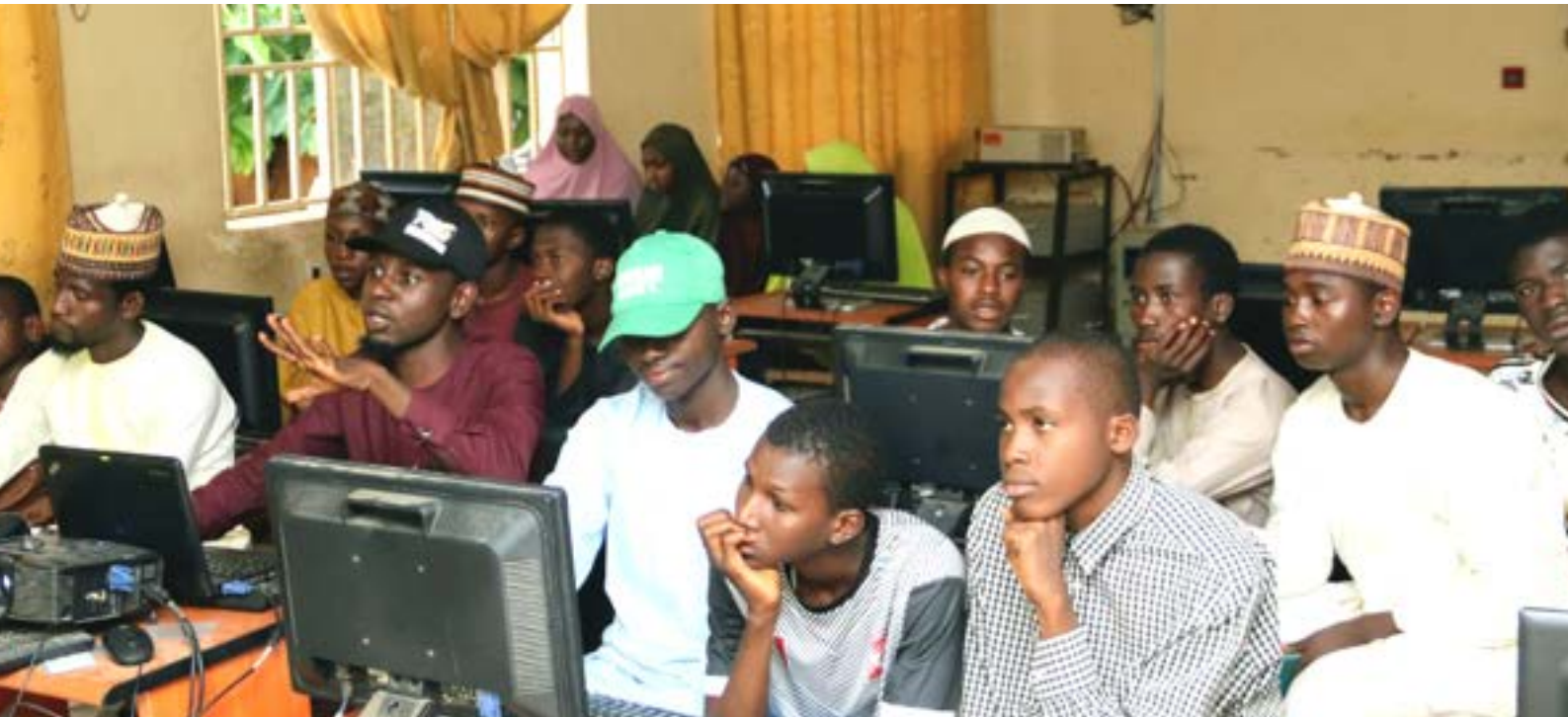
Photo : Participants at the 'Sarakee Skills Aquisition Training for Women and Youth project' in Gombe Nigeria during YDOS 2022

The following key output was achieved under the Goal 9 of the SDGs during the YDOS 2022