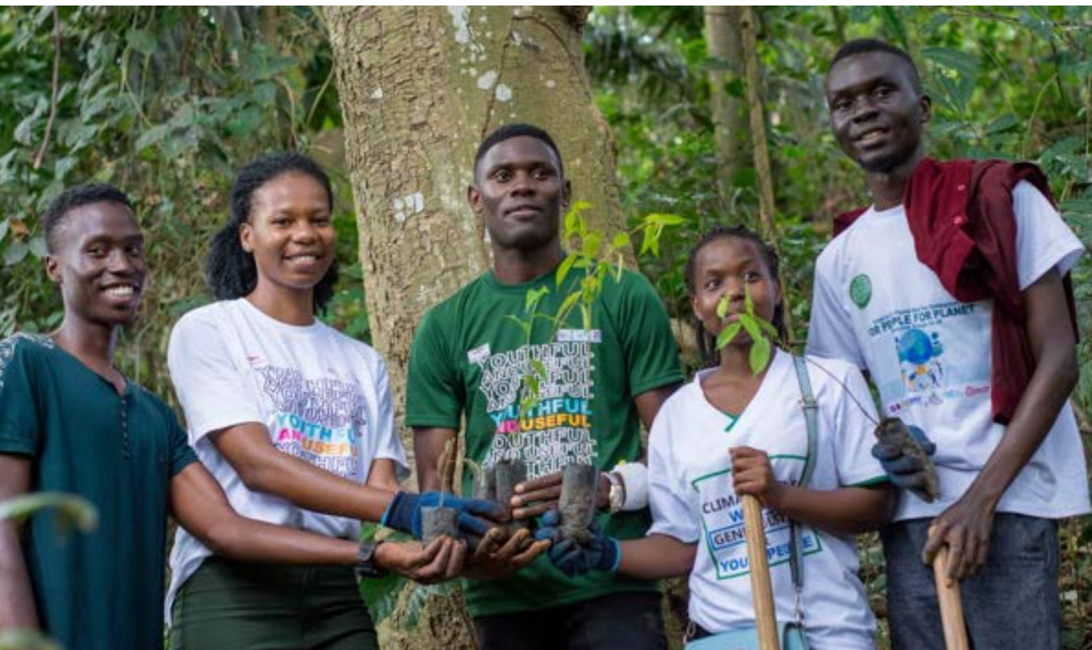
Photo : Volunteers at a tree planting project led by Green Futures Initiative - Uganda during YDOS 2022

The following key outputs were achieved from projects implemented by young people under the Goal 13 of the SDGs during the YDOS 2022