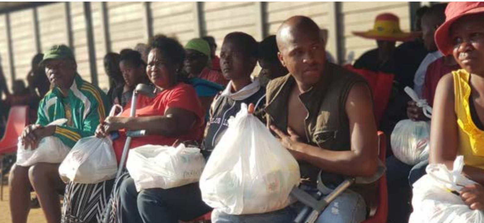
Photo : Individuals receiving food parcel during a food drive for Persons with Disability at Palmridge, South Africa during YDOS 2022

The following key outputs were achieved from projects implemented by young people under the Goal 10 of the SDGs during the YDOS 2022