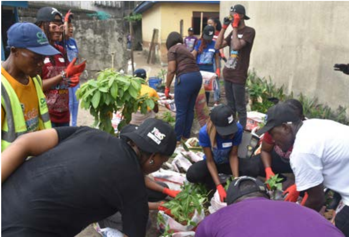
Photo: A group of YDOS volunteers at the 'Plant and Paint project' organised by LEAP Africa, in Lagos, Nigeria

The City of Lagos as other fast growing cities in the developing world is faced with the challenge of maintaining well kept spaces for wellness and recreation needed for relaxation. At Falomo High school, Lagos, the LEAP Africa team saw an opportunity to turn a large refuse dump-located close to the food market- into a beautiful tree and flower beautified food park. The motivation behind the project was to create a recreation space for students as well as to instill in them the art of gardening, thus encouraging them to reclaim abandoned spaces in their local communities to more healthy spaces.