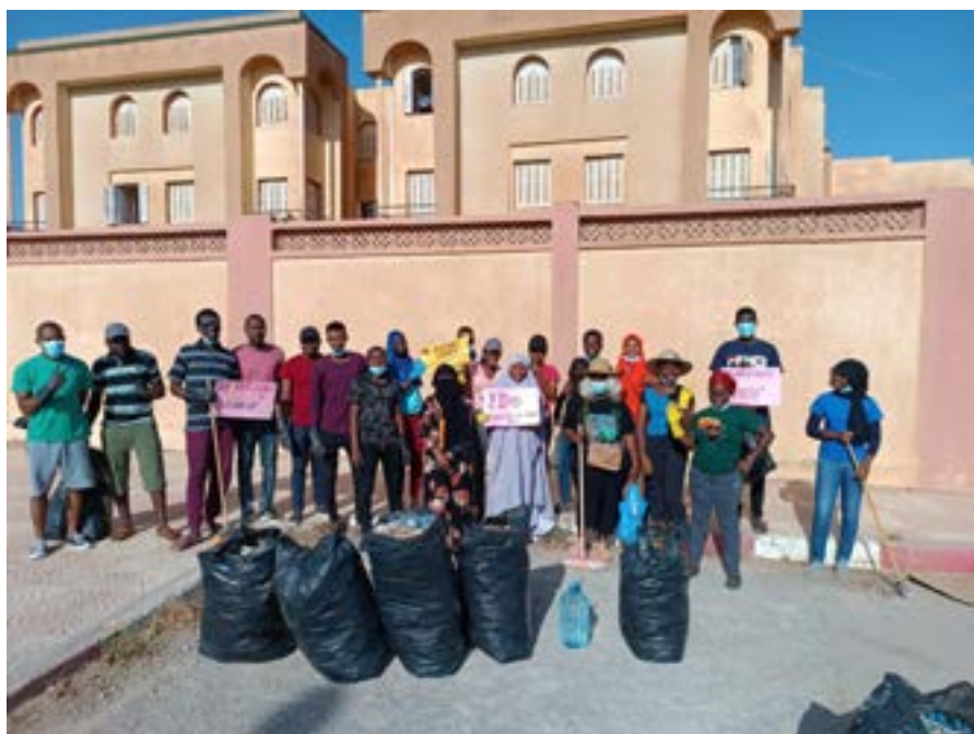
photo: A group of YDOS 2022 volunteers during a school clean up in Tlemcen Algeria