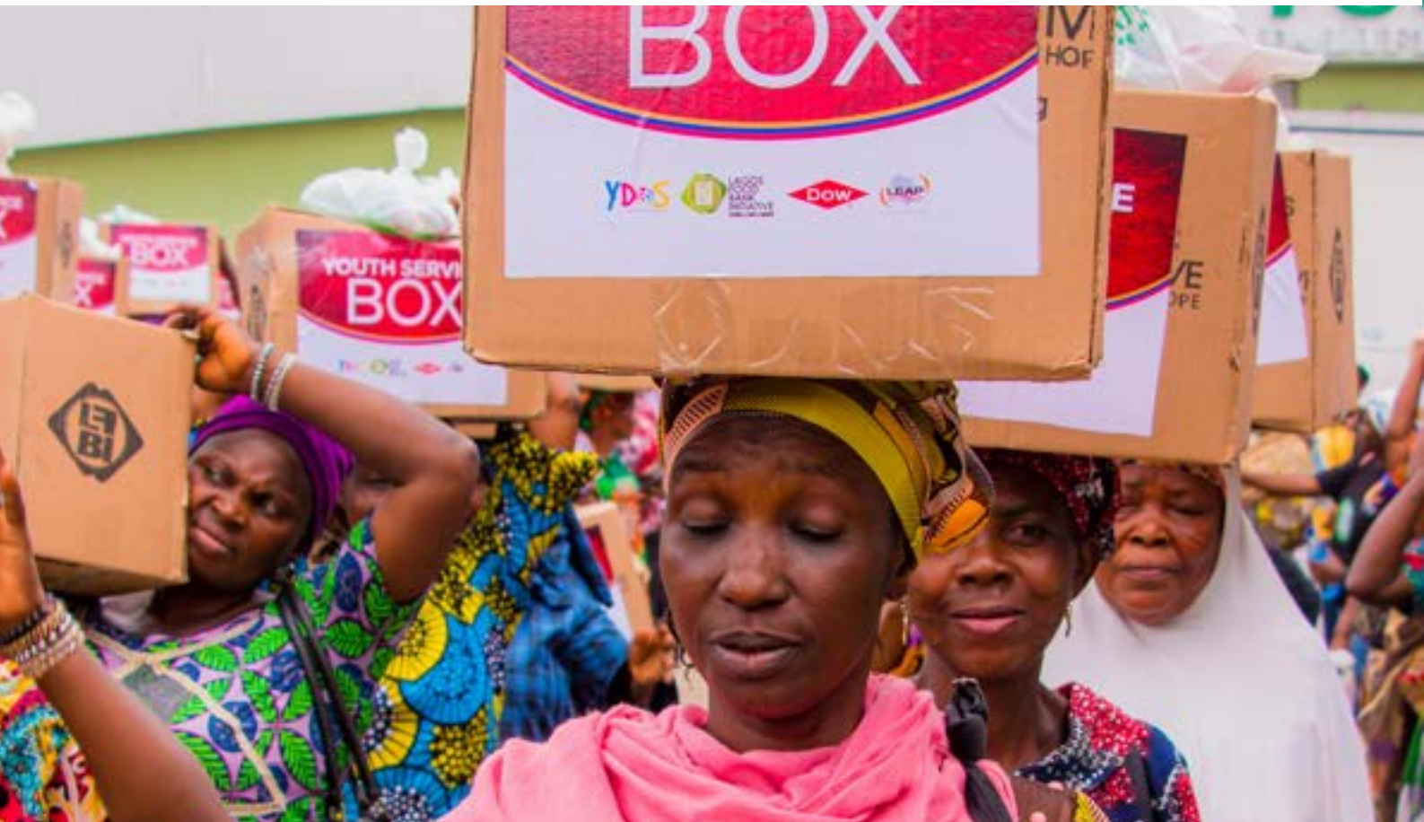
photo: A cross section of individuals carrying their food parcels at a Food drive in Lagos during YDOS 2022

The following key outputs were achieved from projects implemented by young people under the Goal 2 of the SDGs during the YDOS 2022