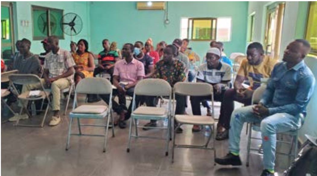
Photo : Participants at the 'Microenterprise project' at Nalerigu, Ghana during YDOS 2022