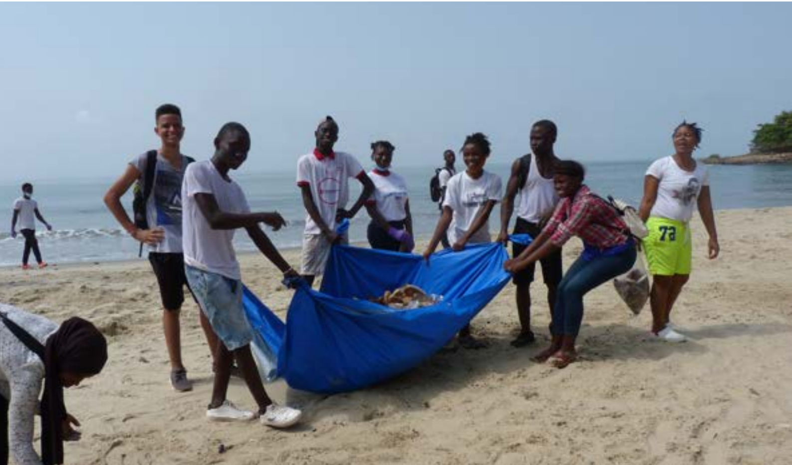
Photo : Volunteers at the 'Beach Clean Up Action project' at Lumelu Beach, Free town , Sierra Leone during YDOS 2022

The following key output was achieved from projects implemented by young people under the Goal 14 of the SDGs during the YDOS 2022