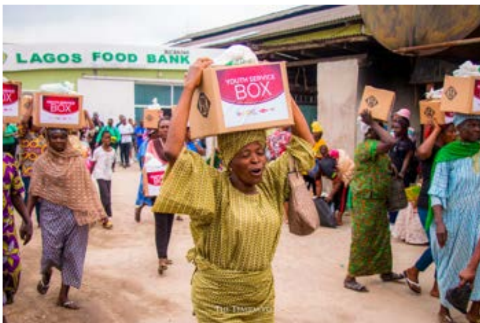
photo: A cross section of individuals carrying their food parcels at a Food drive in Lagos during YDOS 2022