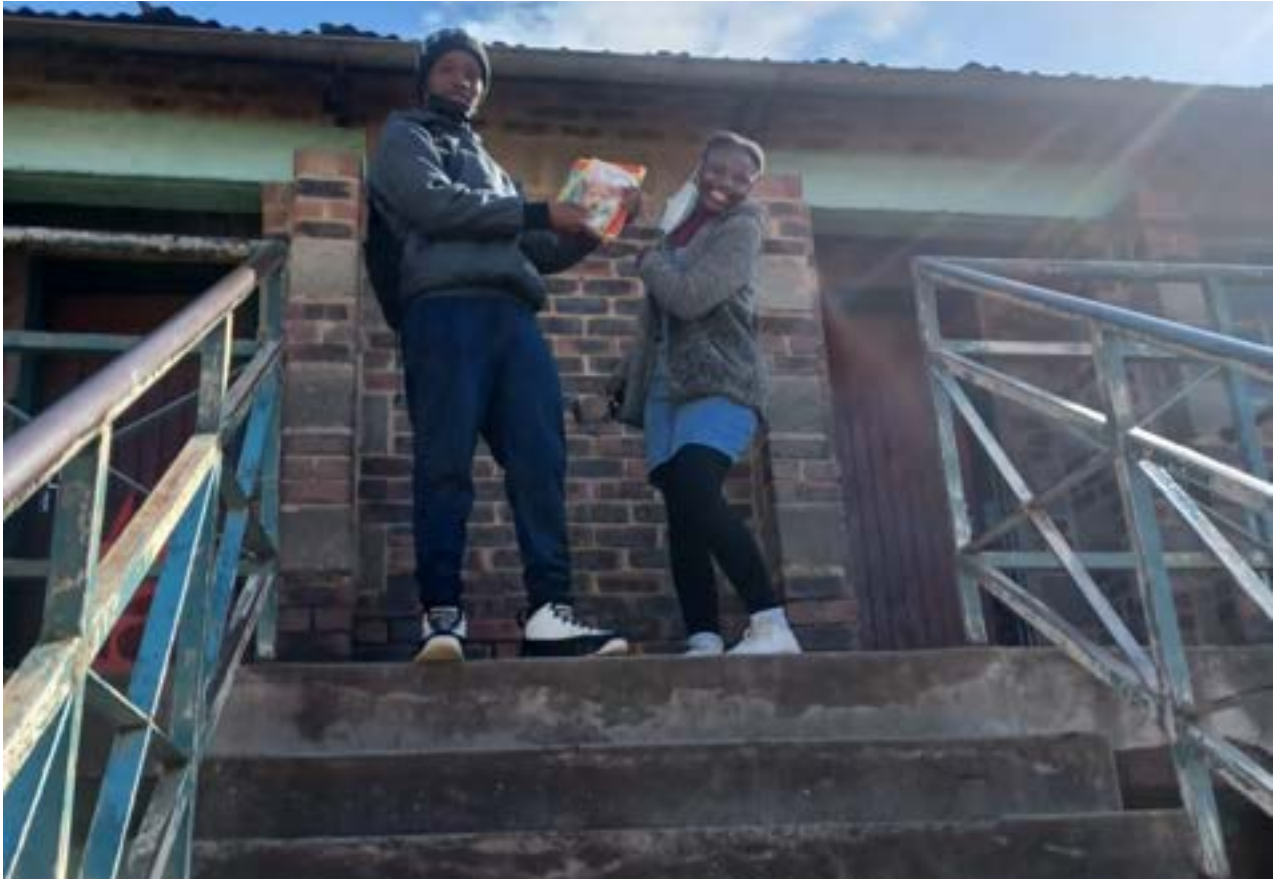
photo: Students pose with book received at the 'Between the Lines Literary project' in Maseru, Lesotho during YDOS 2022

Quality education is necessary for preparing young learners for successful transition into adult life. Success attained by learners in the early years of school prepares them for success at higher levels of learning and ultimately increase their chances of earning gainful employment. For a team of volunteers in Maseru, Lesotho, reading is essential for preparing learners for success. According to the leader of the group: