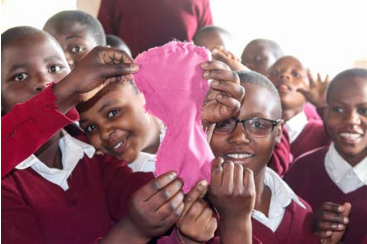
Photo: Female students learning how to make sanitary pads at the 'Sanitary Pads Village' project in Tanzania