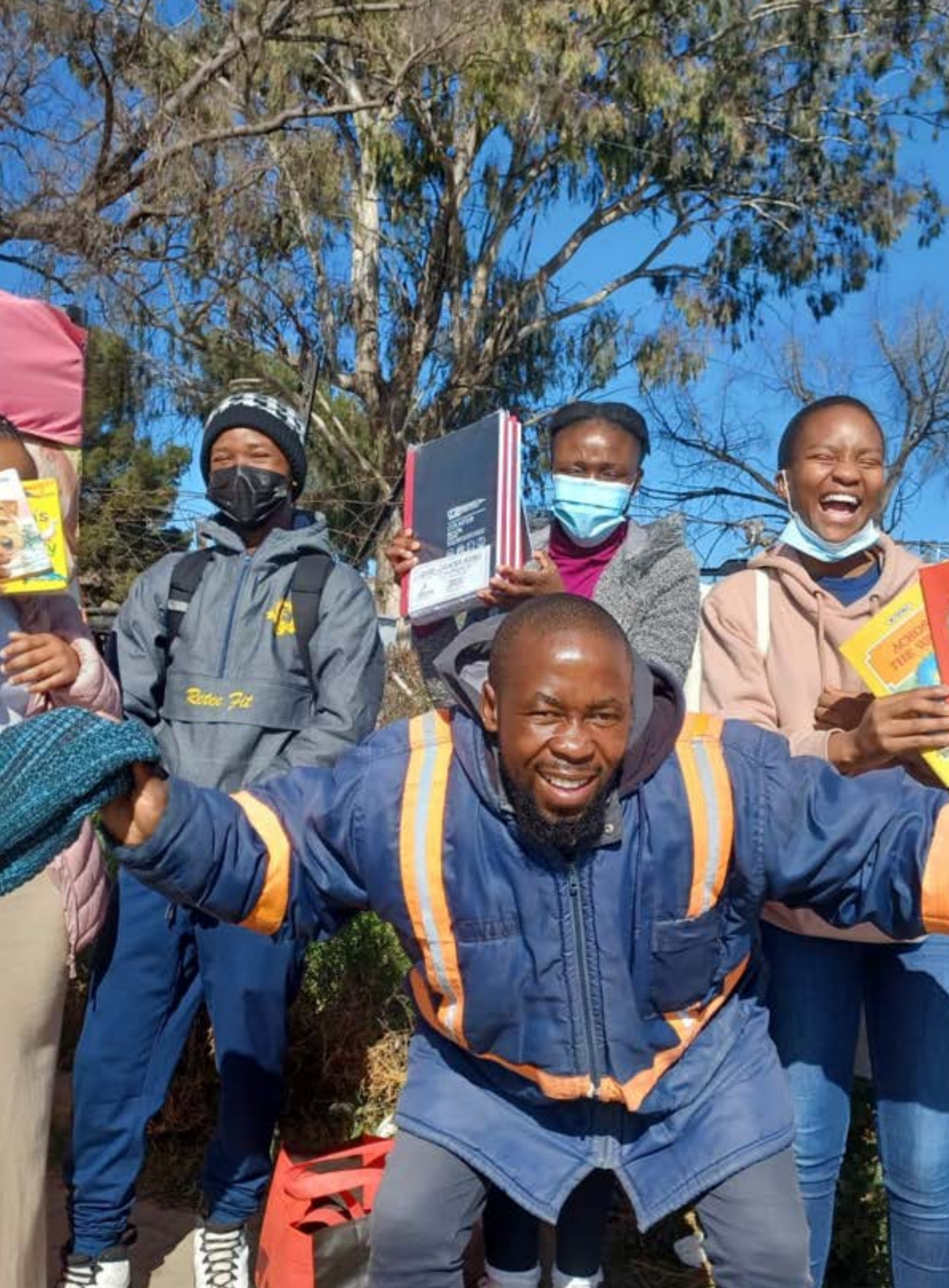
Photo : YDOS 2022 volunteers in Lesotho pose for a photo during the 'Between the Lines Project' - a book donation activity in, Maseru, Lesotho